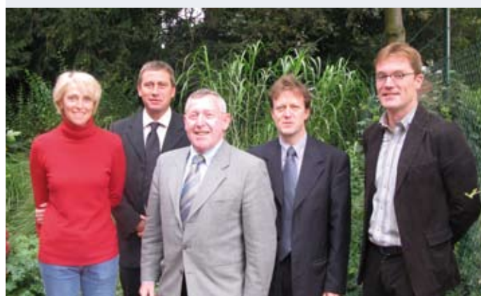
Photo above: The Conference Organising Committee, Ghent University